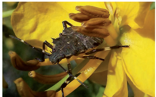
Figure 3. Nymph of H. halys observed in Montjuïc area in Barcelona city.

loaded in http://www.biodiversidadvirtual.org/insectarium/Halyomorpha-halys-(St-l-1855)-img933683.html (Fig. 3). Raval area, Barcelona, Barcelonès (Barcelona, Catalonia), J. Pujade leg. and M. Roca-Cusachs det. (In M. Roca-Cusachs coll.). 10.i.2018: 1 ♂. Inside apartment, Pedro Pons/Manuel Girona streets, Sarrià-Pedralbes area, Barcelona, Barcelonès (Barcelona, Catalonia), L. Álvarez photoleg. and M. Goula det. 18.iii.2018: 1 ex. A picture uploaded in Facebook. Plaça de Sants, Barcelona, Barcelonès (Barcelona, Catalonia), F. Lizana photoleg. and J. Tomàs det., 19.iv.2018: 1 adult, 1 nymph. Five pictures uploaded in http://www.biodiversidadvirtual.org/insectarium/Halyomorpha-halys-(St-l-1855)-img972465.html . Parc de la Solidaritat, El Prat de Llobregat, Baix Llobregat (Barcelona, Catalonia), D. Fernández & A. Zambrana leg. and det. (In D. Fernández coll.). 27.iii.2017: 1 ♀; 9.ix.2017: 1 ♂ & 1 ♀; 14-IX-2017: 1 ♂; 18.ix.2017: 1 nymph; 20-IX-2017: 1 ♂ & 1 ♀; 11.x.2017: 2 ♀; 29.iii.2018: 1 ♀. Can Comas, El Prat de Llobregat, Baix Llobregat (Barcelona, Catalonia), F. Contreras leg. and L. A. Escudero Colomar det. (In IRTA Mas Badia coll.). 11-X-2017: 1 ♂ &