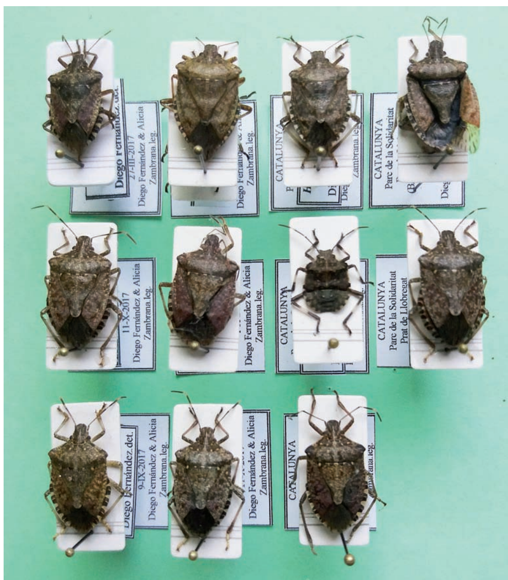
Figure 1. Halyomorpha halys , showing a variety of male and female adult specimens, a nymph.

(Wermelinger et al. , 2008). Cianferoni et al. (2018) provide a good and detailed review, and permanent actualization may be found in CABI (2018). This quick expansion is the result of a variety of factors, some of them intrinsic to biology of the species (Cesari et al. , 2015), and other related to the modern way of life, in which globalization is the core concept (Valentin et al. , 2017). Due to its tremendous invading capacity, the brown marmorated stink bug was in the EPPO alert list from 2008 to 2013.